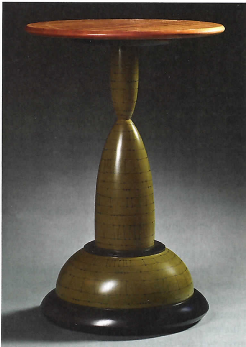
Exhibit starts June 14 at Messler Gallery in Rockport, Maine, while artists and artisans team up in New Hampshire