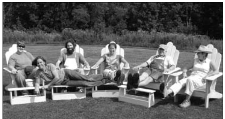
Students sitting on their Really Basic Woodworking projects