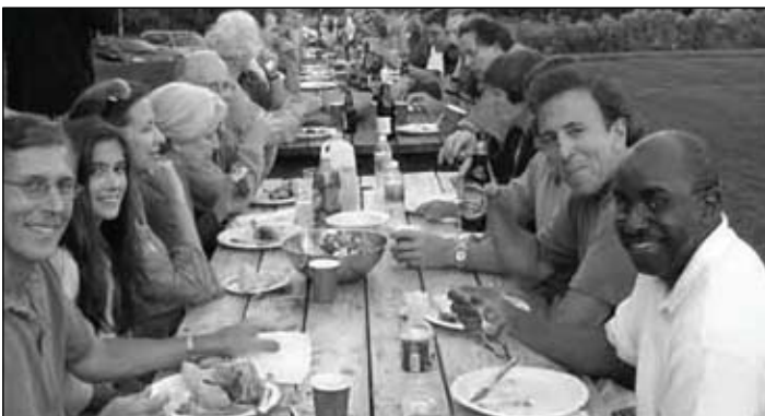
Thursday night lobster potlucks