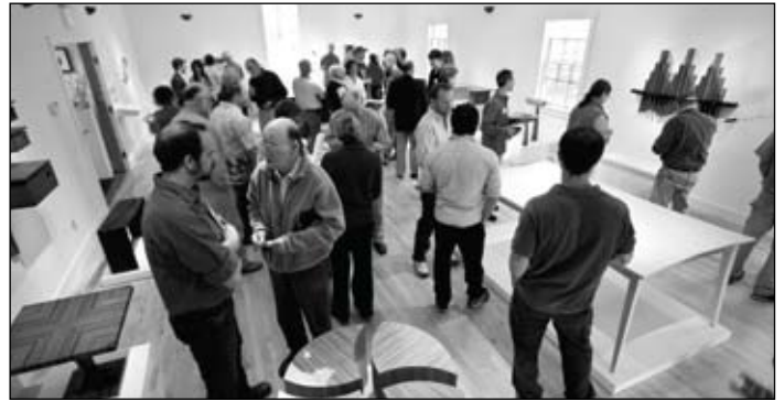
Opening reception for Current Student Work

Lead sponsorship is generously provided by Bangor Saving Bank, with the following co-sponsoring organizations: the Guild of Maine Woodworkers, Kennebec Valley Woodworkers Association, Maine Crafts Association, Maine Woodturners, Maine Woodworkers Association, and Western Mountain Woodturners.