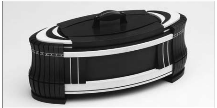
Phil Weber, Oval Exploration (2006), ebony, holly, and silver

Visit www.woodschooll.org/gallery to view all of the work and artists statements.