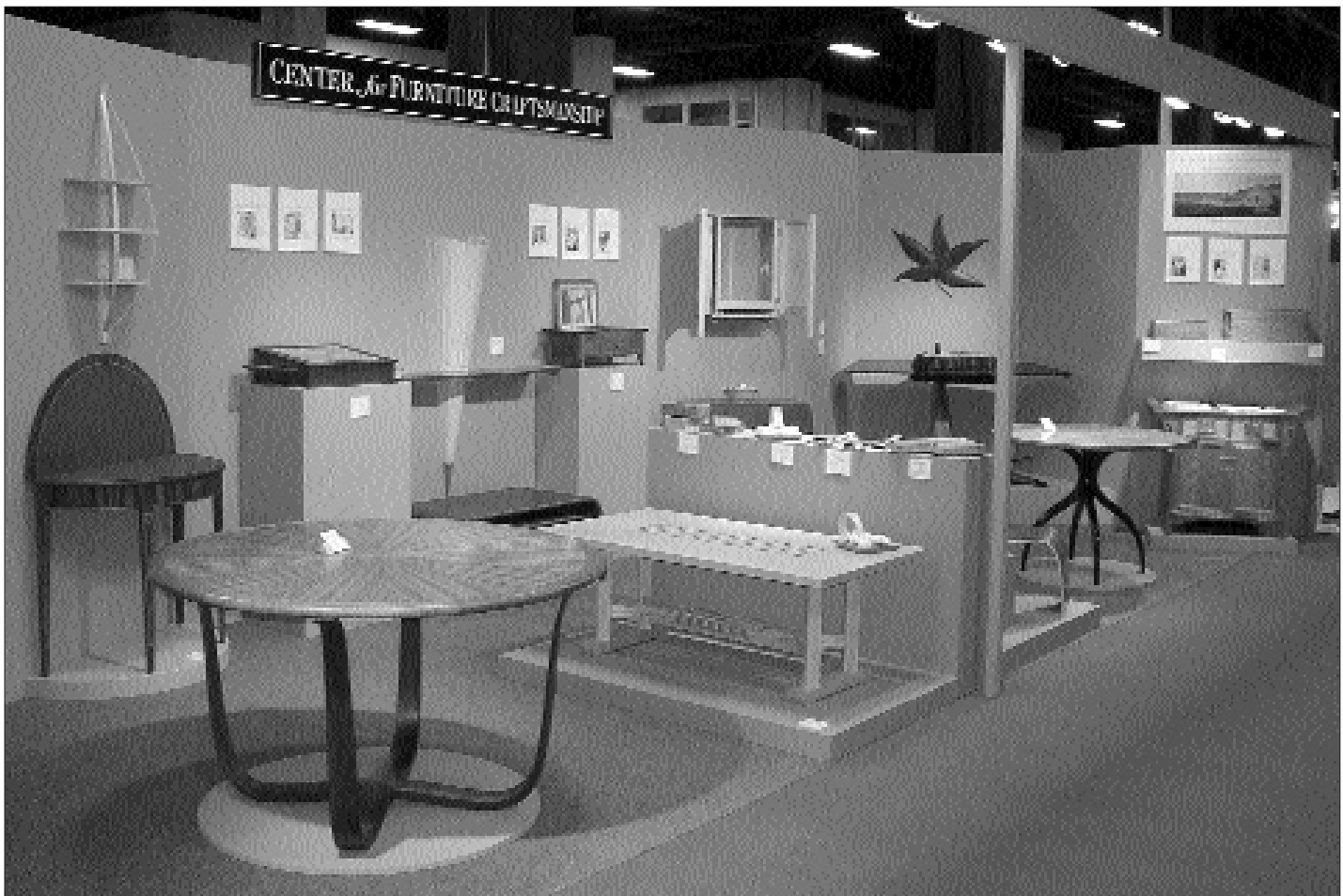
The Nine-month Comprehensive students' booth at CraftBoston last month was a knock-out!