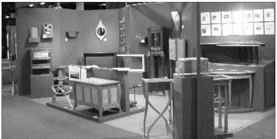
The Nine-month Comprehensive students' booth at CraftBoston, ready for throngs of admirers