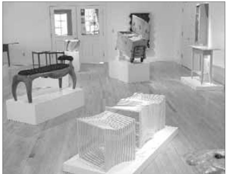
“Celebrating the Studio Fellowship” runs until June 22nd.