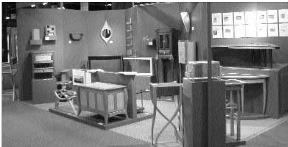
The Nine-month Comprehensive students' booth at CraftBoston, ready for throngs of admirers