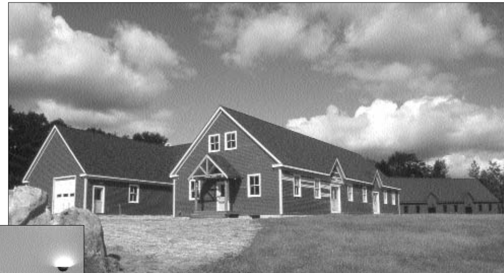
The new Main Building, which will provide space for a Nine-Month Comprehensive course and an additional Twelve-Week Intensive