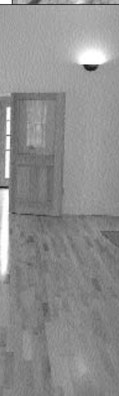
Looking from the Gallery toward the Fine Woodworking Library in the new Gallery Building