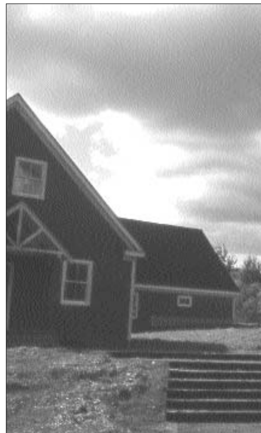
Looking westward from the croquet court, one sees the new Main Building (left) and the library entrance of the new Gallery Building (center).