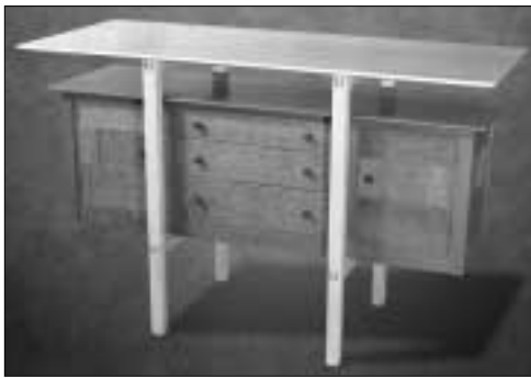
Bolton Buffet. Hard maple top and legs; cherry cabinet, 60" long, 39" tall, and 23" deep. July, 1999.