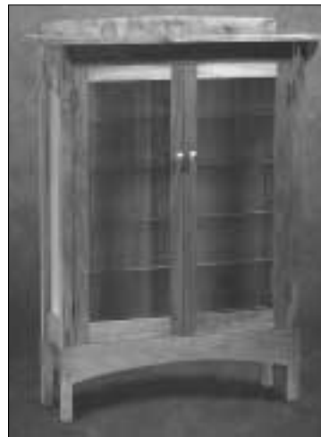
Goldenhar Cabinet. Walnut with glass shelves and interior lights, 60" tall, 36" wide, and 13" deep. November, 1999.

to get set up and you need an alternative source of income (His wife, who is extremely supportive, has a University position) and don't expect results to happen overnight."