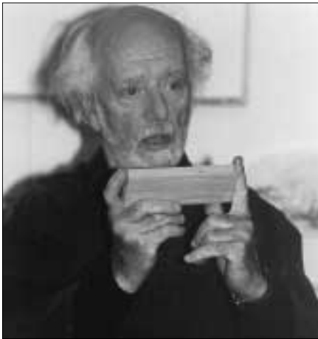
Jim Krenov teaching at the Center in 1996.

from the University of Kansas, in 1961. His work is included in the permanent collections of almost thirty museums, including the Museum of Modern Art in New York and the Smithsonian Institution in Washington, DC. From 1980–88 he operated the Wendell Castle School, considered by many the best school of its time for aspiring furniture makers. Wendell was a participant in the pivotal Woodenworks show at the Renwick Gallery in 1972. Among many honors, he became an Elected Fellow of the American Crafts Council in 1986; received an NEA Fellowship in 1988; was awarded Honorary Doctor of Fine Arts degrees from the Maryland Institute of Art and the State University of New York, Brockport; and received the Furniture Society's Award of Distinction in 2001.