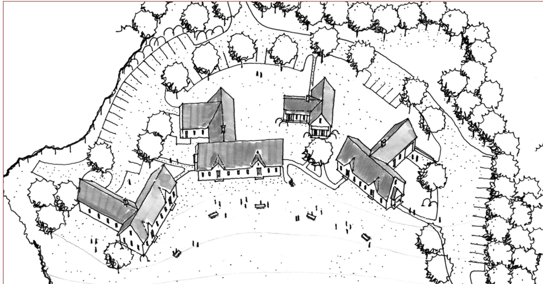
Drawing by Dennis Prior

The Center's new programs, like its current ones, derive from an institutional understanding of the role of craftsmanship in the modern world. The school's