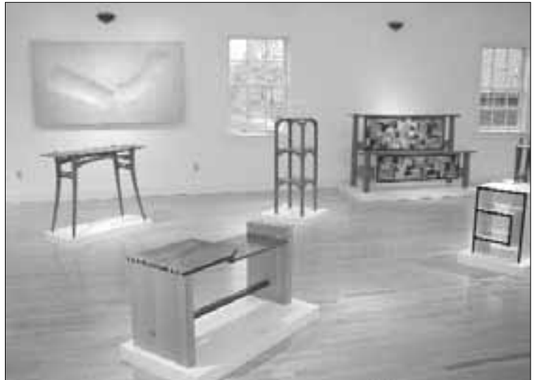
“Work by Studio Fellows” runs in the Messler Gallery until June 15th.