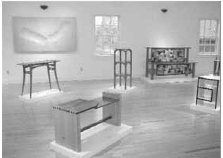
“Work by Studio Fellows” runs in the Messler Gallery until June 15th.